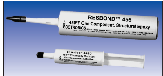
Single Component Adhesive in Ready to Use 4 oz. and 11 oz. Caulking Tubes